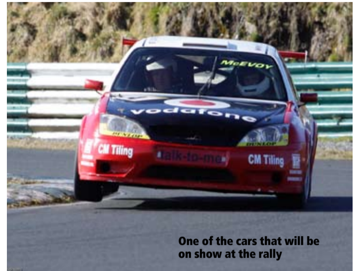
One of the cars that will be on show at the rally

So we are in for a fantastic day's motorsport at Whiteriver Park and the action which starts at