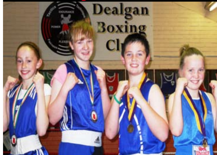
ABOVE: Some of the latest Dealgan BC fighters after their successful stint at the Nine Counties Championship held at the National Stadium