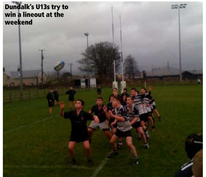
Dundalk's U13s try to win a lineout at the weekend

hold Coleraine scoreless for the period. When they were returned to the full complement, Dundalk dialled up the pressure and pushed Coleraine back towards their own line, gaining a lineout on the 15m mark.